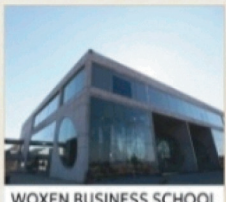
WOXEN BUSINESS SCHOOL