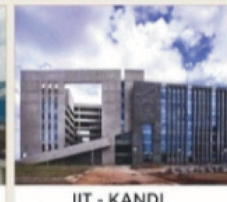
IIT - KANDI