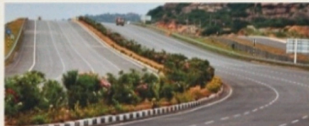
NATIONAL HIGHWAY - 65