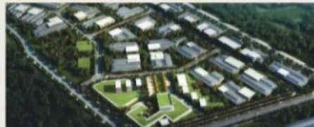
ZAHEERABAD - NIMZ