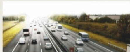
PROPOSED REGIONAL RING ROAD